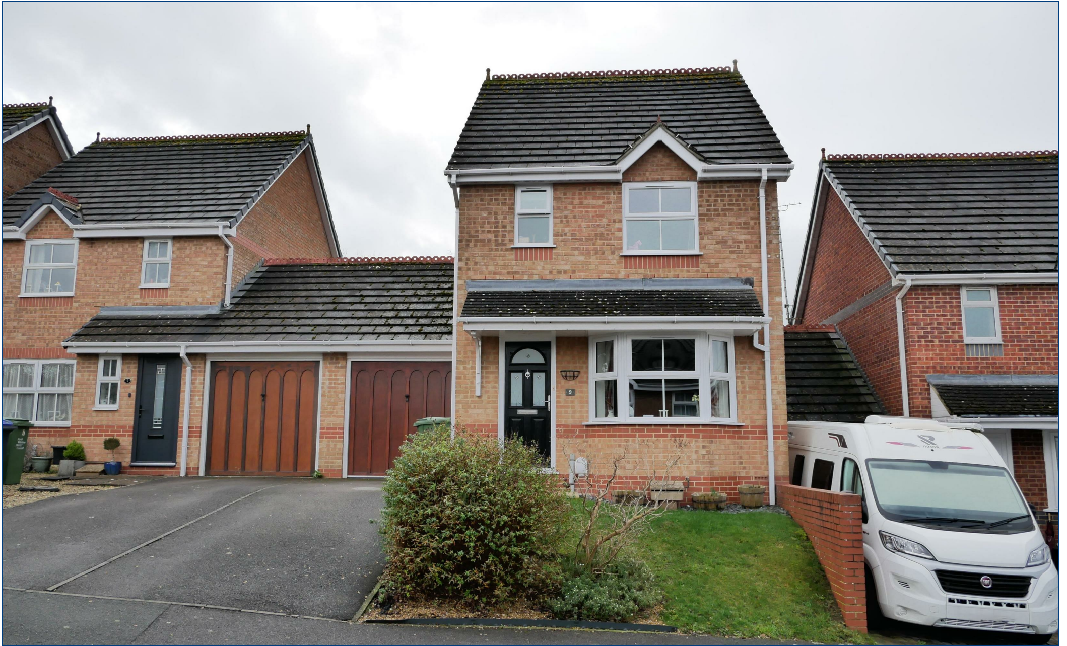
Portland Way, Calne £290,000